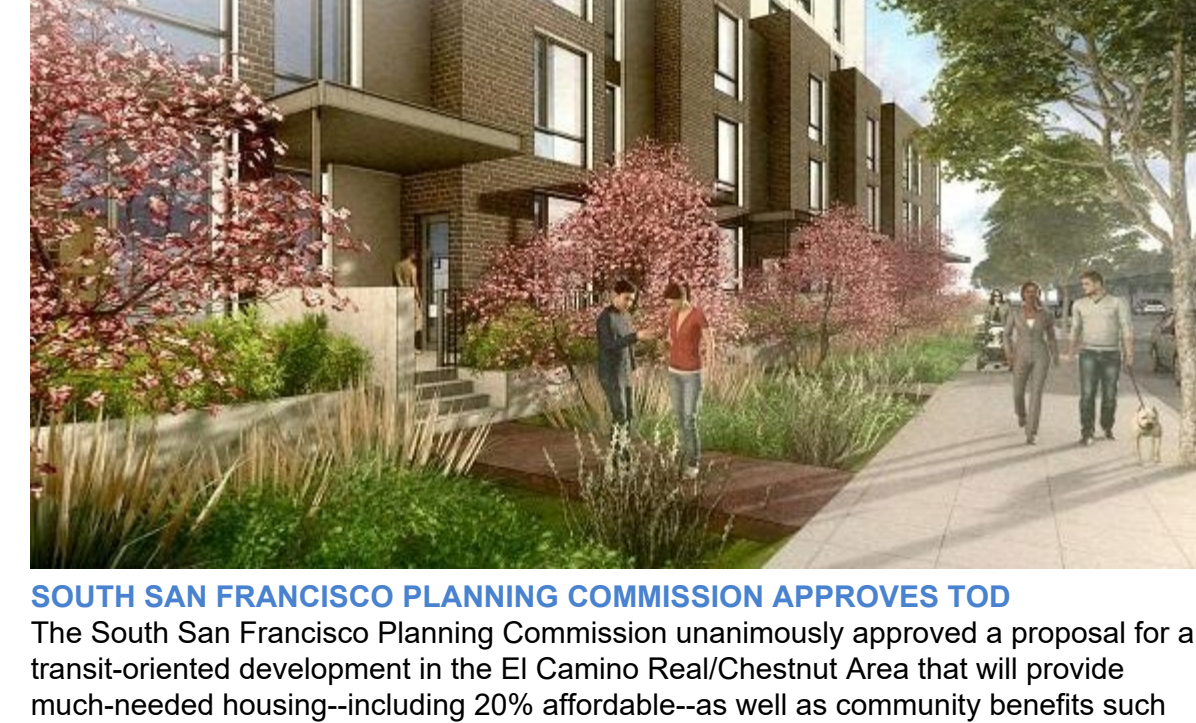
as childcare, parks, open space and a market hall. The city selected AGI Avant (now

services that support children's school readiness, literacy, workforce development, early childhood care and technology access. It's situated in Mandela Gateway, developed and owned by BRIDGE, where 168 affordable apartments are co-located with community-serving retail and commercial space. Read more