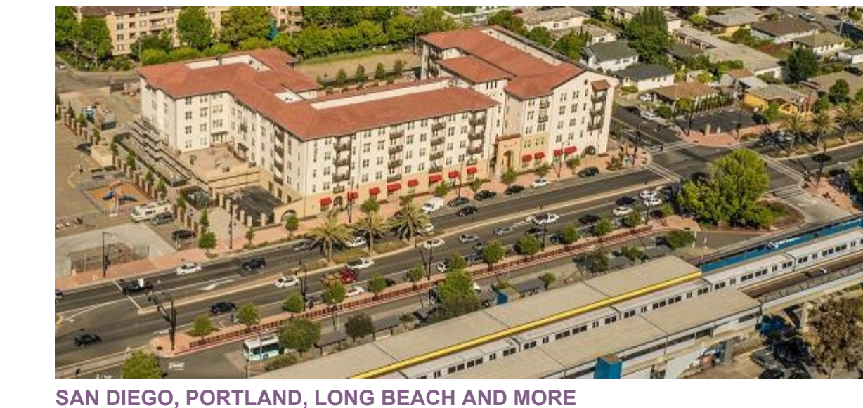
pieces in the Portland Business Journal, the San Diego Union-Tribune and the Long Beach Business Journal. VISIT & EXPLORE