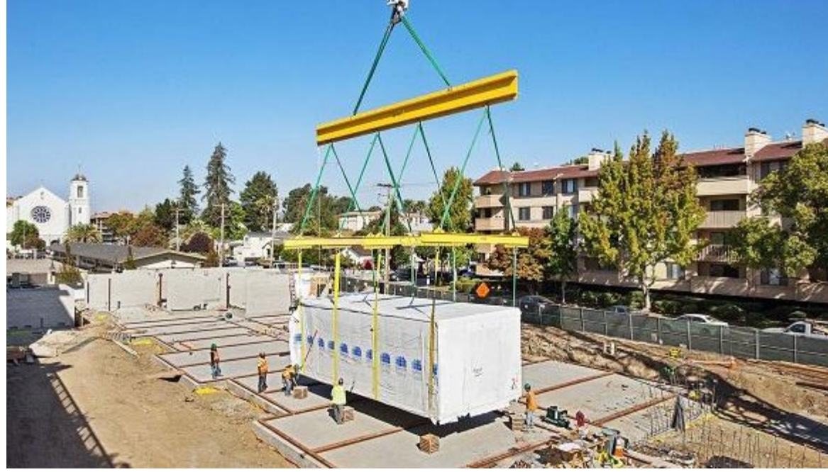
NEW PAPER FOCUSES ON COST-CONTAINMENT